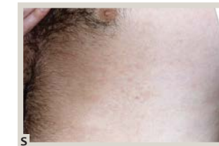
Subtle Macular Rash